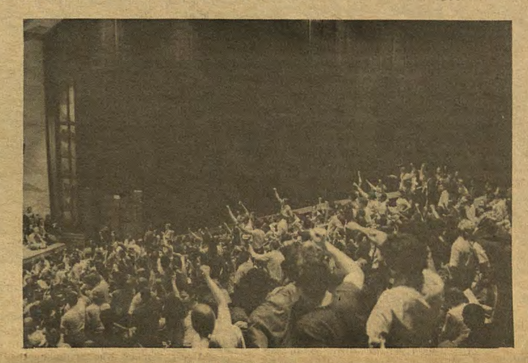
"Smash Racism!" "Ally with Workers!" Inside the plemary session at the Cleveland Conference

the population, that the bosses for whose benefit the war is fought use racist justifications like they're only yellow people, etc., who don't even care what kind of government they have', and that working people, and especially black working people, are the ones who have to pay for the war. The SMC/YSA said that racism is a side issue. The slogan of the SMC, 'Bring the Troops Home Now', is in itself racist: it's all right for Asian mercenaries to protect US attempts to build an empire in Southeast Asia as long as American soldiers aren't dying. The SMC/YSA proposal for a referendum also has racist implications for it 'suggests that a vote by Americans could decide whether or not the US government attacks on Vietnamese working people are justified' (SDS proposal, page 3). The SMC also suggested that struggles which really fight