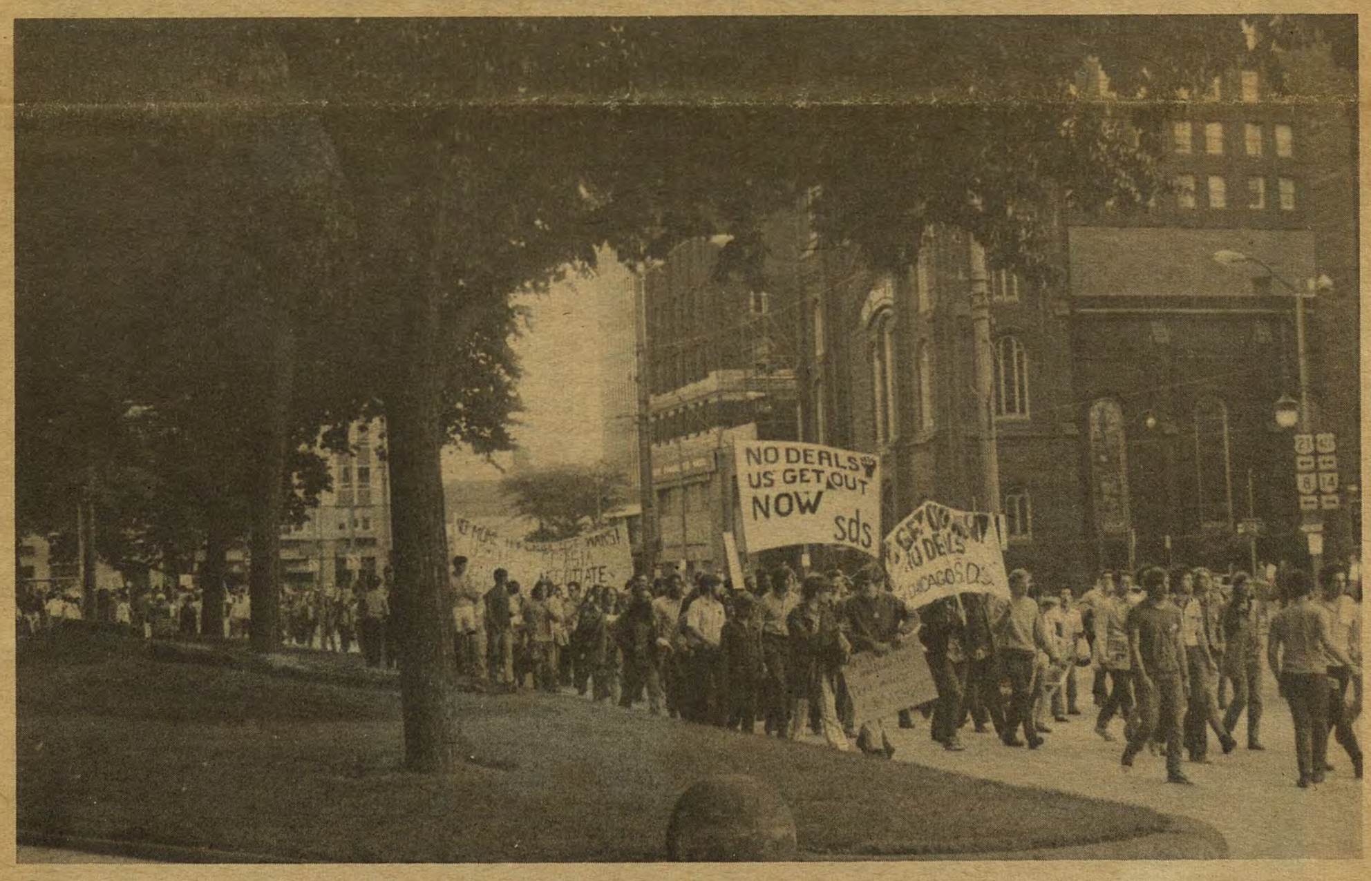
SDS-led demonstration in Cleveland against Agnew and Mayor Stokes: TWO SIDES OF THE SAME COIN--Stokes smashes black rebellions, Agnew backs the Cambodian invasion.