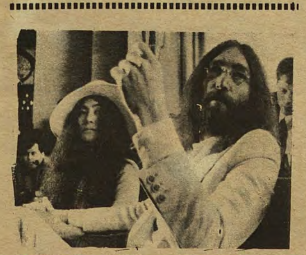
Lennon's message: "Free your mind instead."