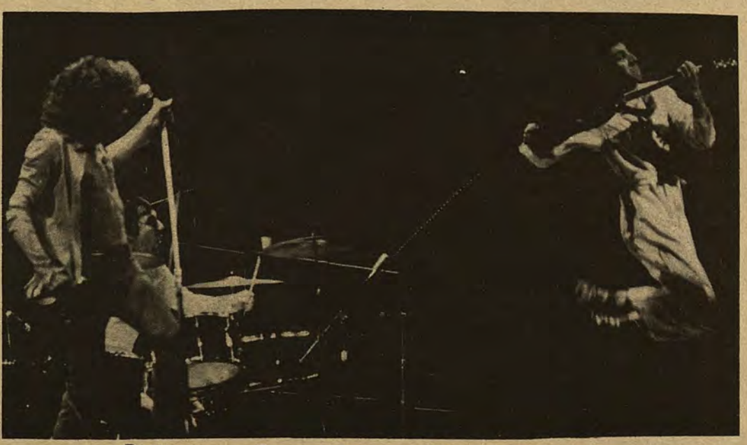
Rock opera Tommy tells us "Don't fight back"

Out of this music of the fifties developed today's billion dollar rock music industry. And today 'rock and roll' is not only directed at working class youth but has expanded to include the middle class students. Supposedly the rock music of today offers more than disillusionment and a privatized existence. It claims to offer an alternative: joy, happiness, a kind of communal or-