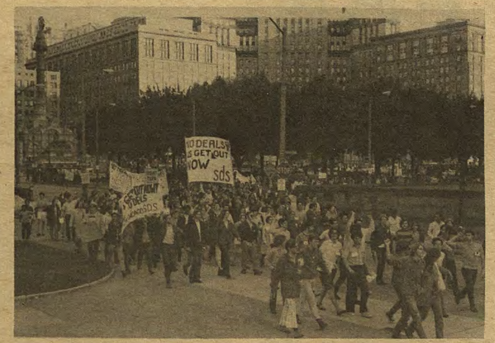
Crowds march from SIC demo to SDS anti-Stokes demo at City Hall

back against the bosses in this country (the bosses who wage the Vietnam war and who also superexploit black people) should be avoided because they would alienate workers and black and brown people. This is a racist attack on the Vietnamese working people who have, of necessity, violently fought back against the US aggressors, and on the militancy of black and white working people, who have fought back in wildcat strikes and ghetto rebellions in this country. SDS, on the other hand, said that strikes and ghetto rebellions should be supported, and that racism should be fought wherever we encounter